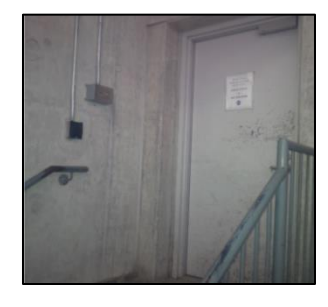
Use buzzer or call PHOL contacts posted on door.