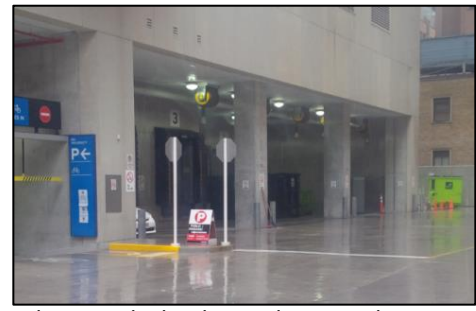
Shipping dock is located past underground parking entrance.