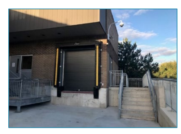
The shipping dock for dropping off all clinical testing specimens (courier deliveries and STATs).