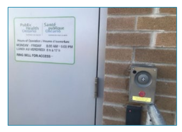
The personnel door by the shipping dock and the buzzer.