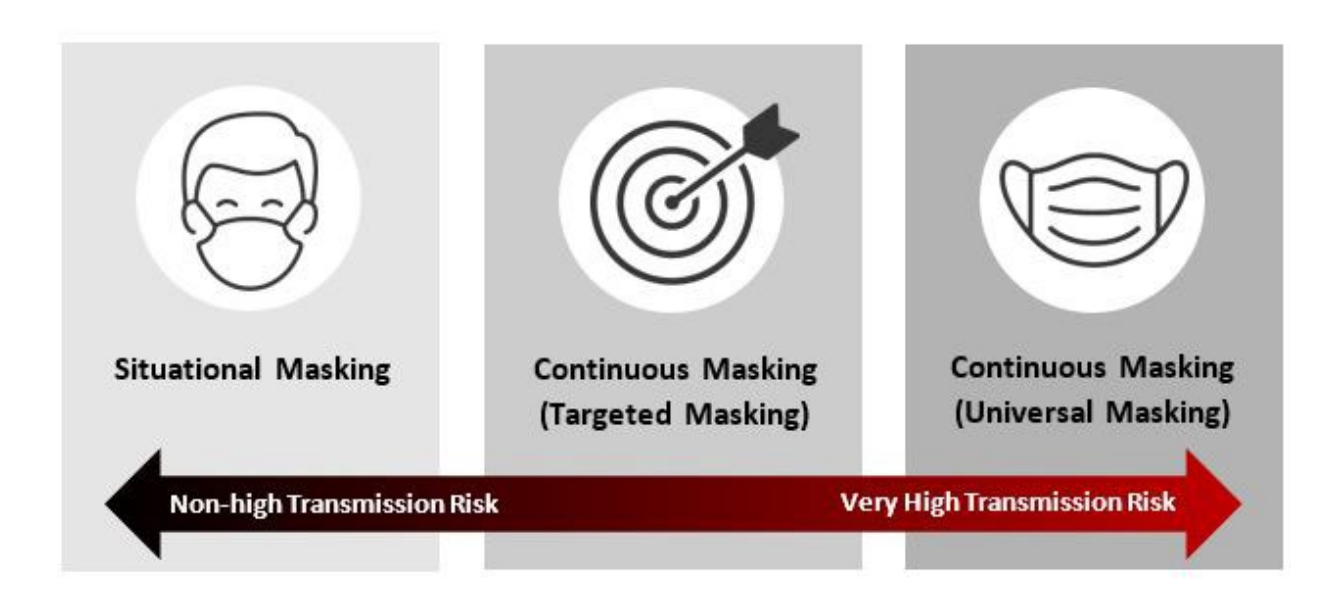
Figure 3. Spectrum of Masking Recommendations for Non-high to Very High Transmission Risk Periods

Adapted from: Ontario Health, Toronto Region Masking Community of Practice Committee; Merkley J, Cass D, Hota S, Johnstone J. TR HOT – changes to masking guidance: summary of assumptions, recommendations & operational guidance. Toronto, ON: King's Printer of Ontario; 2023 Jun 30. Progression of masking policies in clinical areas, p. 5