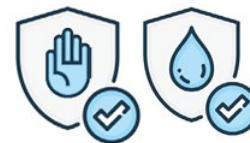
Additional Precautions for Acute Respiratory Illness (ARI)

Continue Additional Precautions until there is no longer a risk of transmission of most microorganisms or illness. Ongoing assessment of the risk of transmission is to be performed and in some instances additional expert consultation may be required. Each one of these categories will be discussed in the following sections with examples of diseases and conditions including infection control measures required under each category.