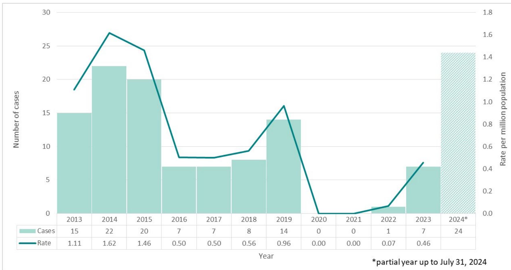
Figure 2: Number of Measles Cases and Incidence Rate Per Million Population: Ontario, January 1, 2013 – July 31, 2024