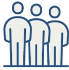
Figure 1: Roles and Responsibilities Within the Ontario Vaccine Safety Surveillance System