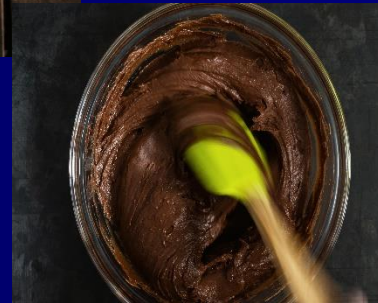
Note. From Microsoft Office Stock Images, 2023