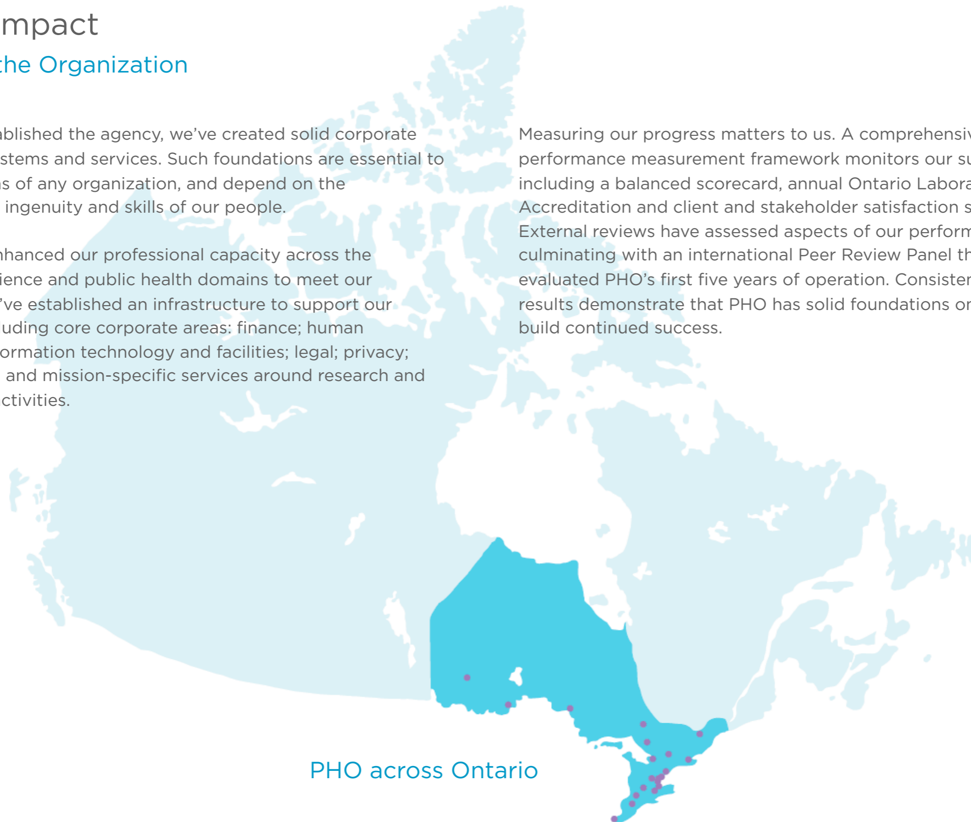
PHO across Ontario

Measuring our progress matters to us. A comprehensive performance measurement framework monitors our success, including a balanced scorecard, annual Ontario Laboratory Accreditation and client and stakeholder satisfaction surveys. External reviews have assessed aspects of our performance, culminating with an international Peer Review Panel that evaluated PHO's first five years of operation. Consistent positive results demonstrate that PHO has solid foundations on which to build continued success.